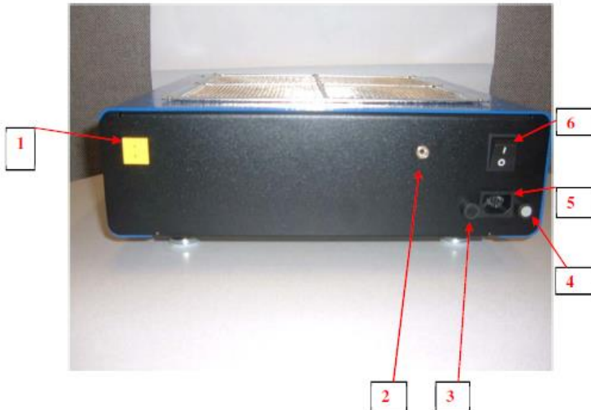
Figure 2 Rear Panel Identification