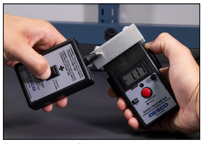
Figure 10. Using the Charger to apply a charge onto the Conductive Plate

NOTE: A ground path must be provided between the touch plate of the Charger and the ground reference of the Digital Static Field Meter. This is normally provided by holding the Charger in one hand and the Digital Static Field Meter with Conductive Plate in the other.