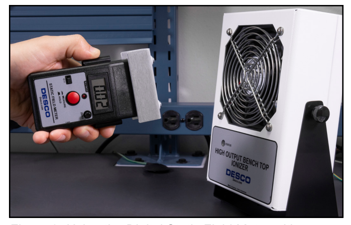
Figure 9. Using the Digital Static Field Meter with Conductive Plate to measure the offset voltage of a benchtop ionizer

NOTE: When testing pulsed ionizer systems, the voltage displayed is constantly changing. This pulse rate may be faster than the display update rate of the Digital Static Field Meter, therefore the displayed voltage is an average of the actual voltage. The output of the Digital Static Field Meter is useful in this situation for more accurate measurements.