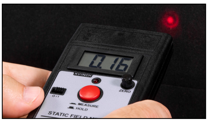
Figure 7. Aligning the two bullseyes emitted by the LED range indicator