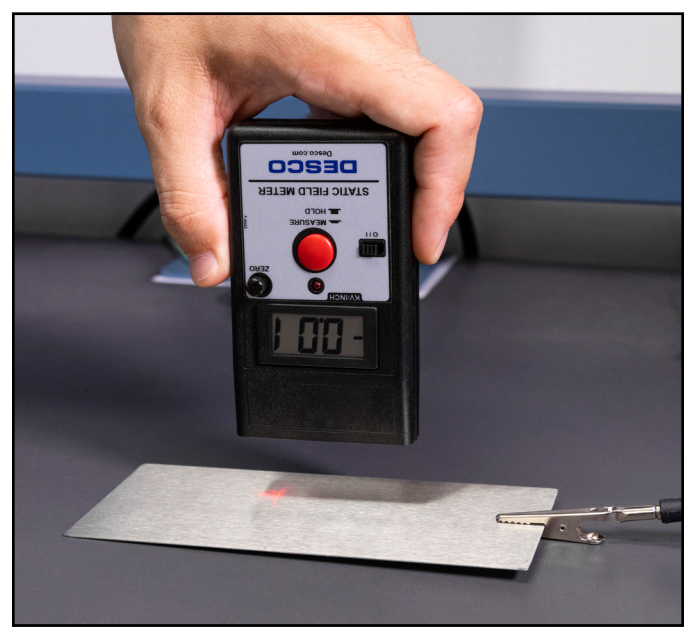
Figure 6. Pointing the Digital Static Field Meter to a grounded surface

Slide the power switch to the right to power the Digital Static Field Meter. Point the top of the Digital Static Field Meter approximately 1 inch (2.5 cm) away from a grounded metal surface. Proper spacing is indicated when the two red bullseyes emitted LED range indicator become centered on top of each other. Turn the rotary zero knob until the Digital Static Field Meter's display reads 0.00.