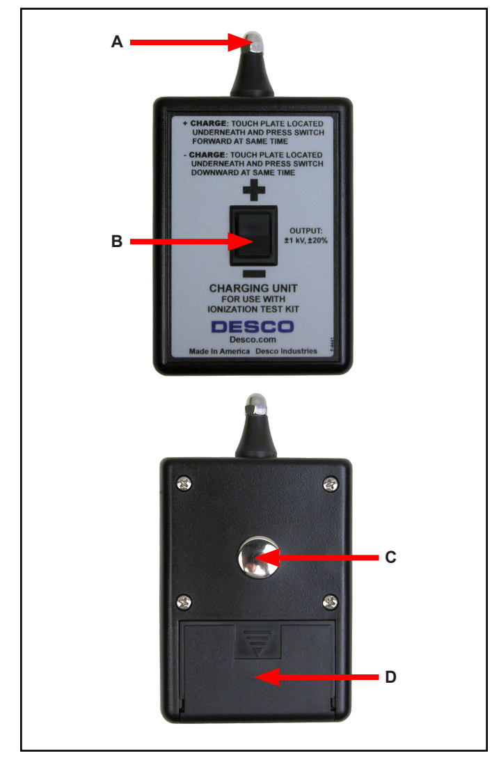
Figure 5. Charger features and components