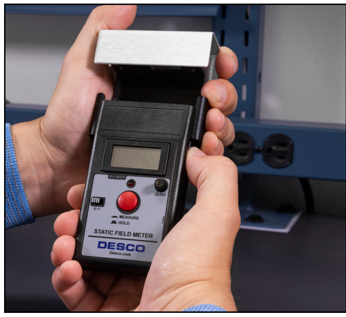
Figure 8. Sliding the Conductive Plate onto the Digital Static Field Meter