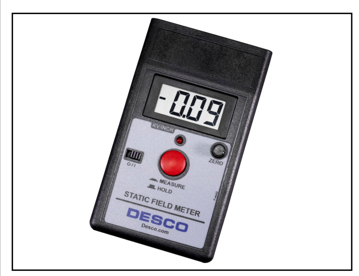
Figure 1. Desco 19442 Digital Static Field Meter