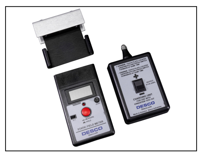
Figure 2. Desco 19443 Air Ionization Test Kit