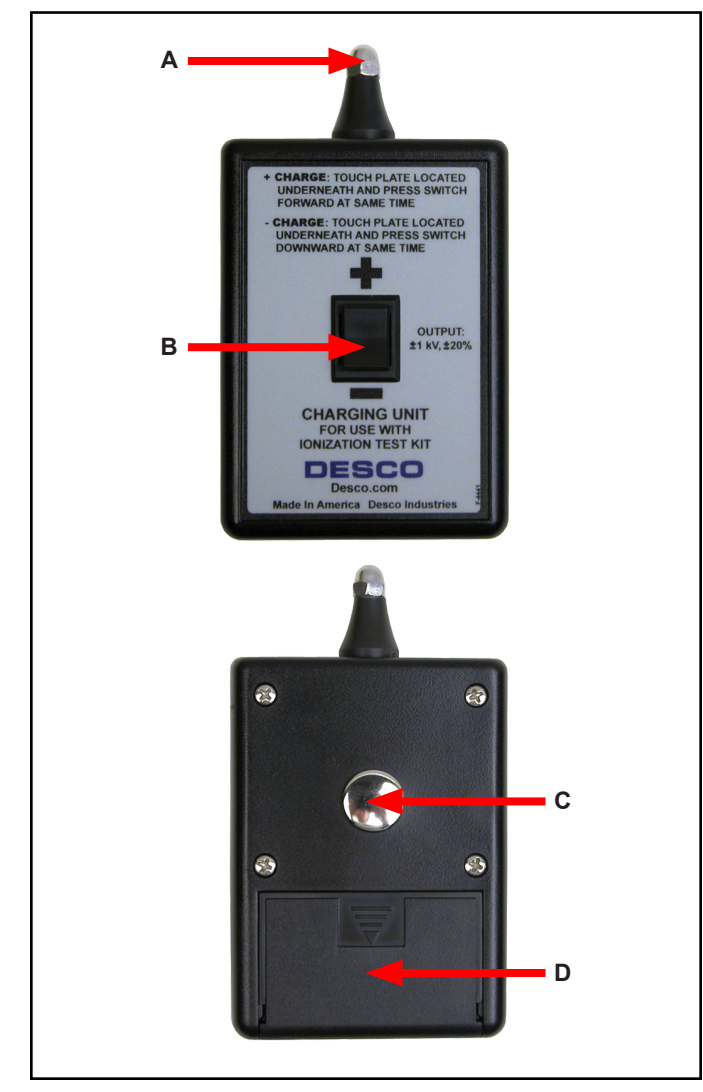
Figure 5. Charger features and components